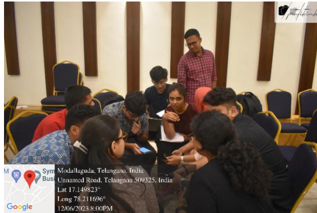
( The teams playing the game )

Outcome: The students were able to connect by challenging their analytical and technical skills, making the event an effective way to introduce the new batch and encourage conversation. The event was immensely anticipated and successfully executed.