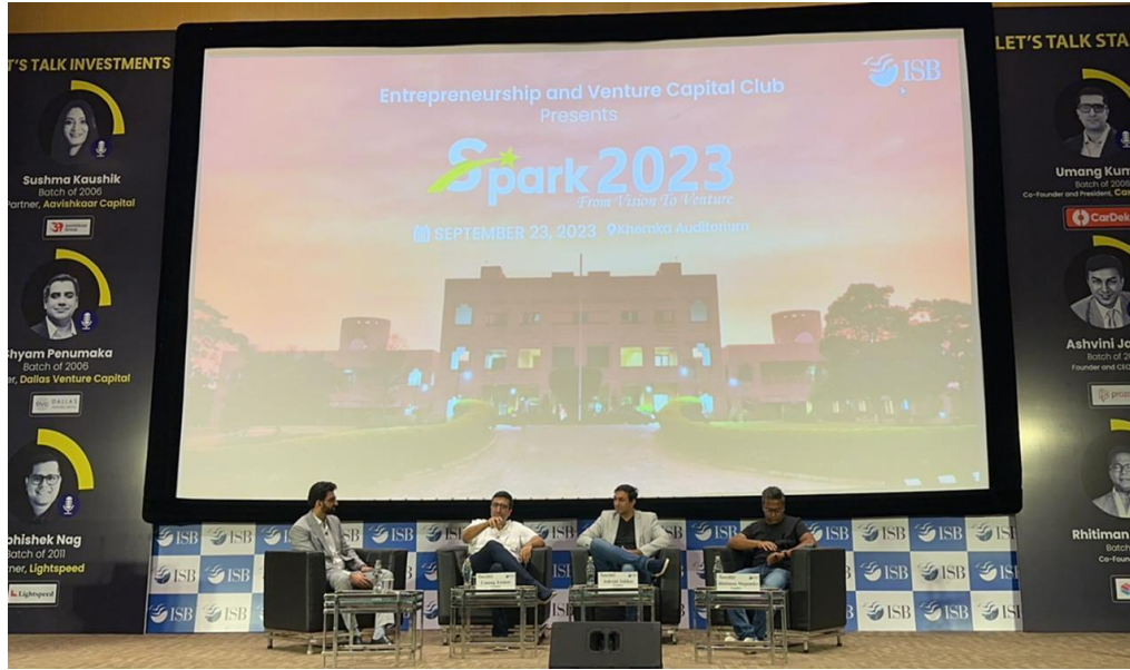
( Spark 2023 Panel Discussion @ ISB Hyderabad )