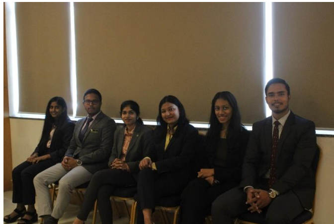
(Finalists of Pitch Perfect)