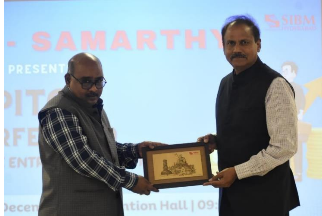
(Felicitation of guest by Faculty In - charge E-Cell)

Outcome: The event sparked an innovative and entrepreneurial spirit, fostering creative problem-solving and communication skills alongside valuable networking opportunities.