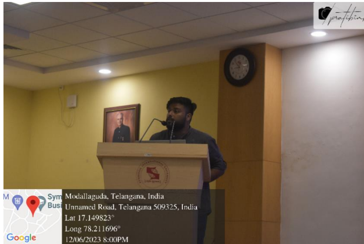
( Participant presenting before the judges. )