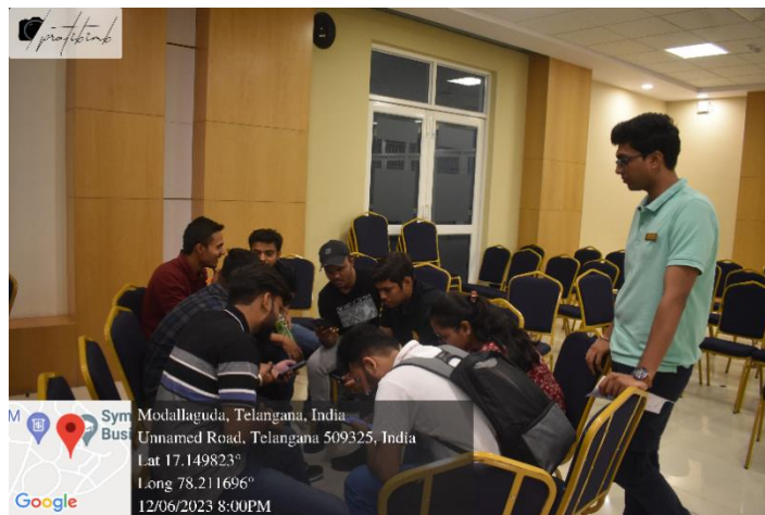
( The teams playing the game )